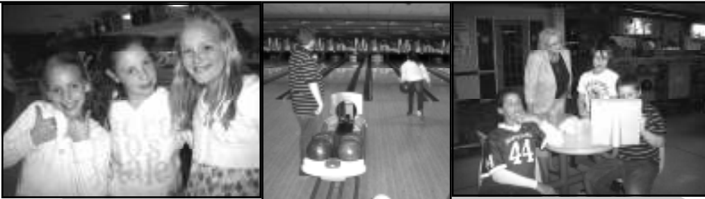
Preteens rock at bowling!